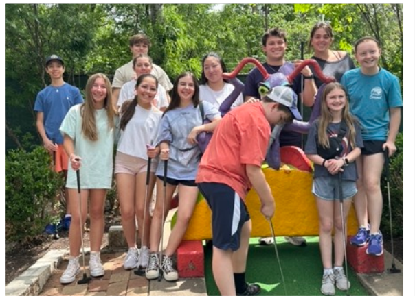
EYC Peter Pan Mini Golf outing on April 7.