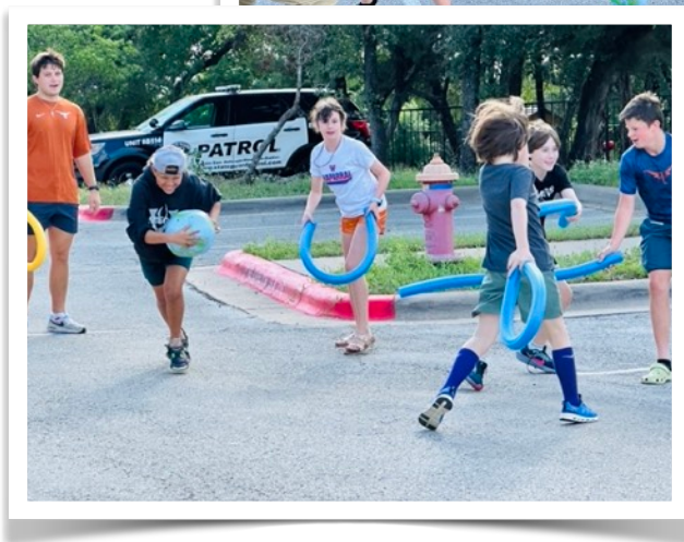
Noodle hockey in the parking lot at the last SMEYC!!