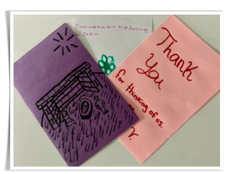
Thank you cards from the children of St. Francis Ministries.

One Good Turn (global health in underserved communities)