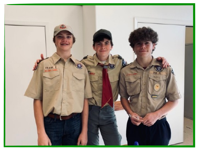
Boy Scout Troop 30 are growing through their care of our trails and the many other projects they do here and through here.