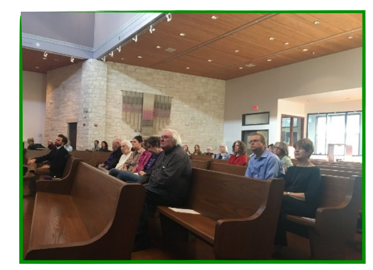
Learning something new is always life giving; our Lenten Speaker Series is one such opportunity.