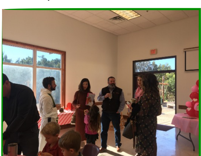
The parish hall is such fertile ground for growing relationships, as on Fourth Sunday 4 families.