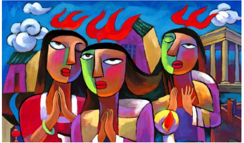
Holy Spirit Coming, by He Qi

https://malcolmguite.wordpress.com/tag/pentecost/