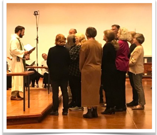
Stephen Ministers Commissioning, 2022