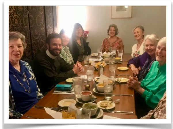
Daughters of the King luncheon, 2022