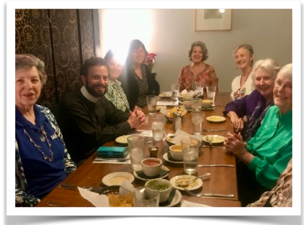
Daughters of the King luncheon, 2022