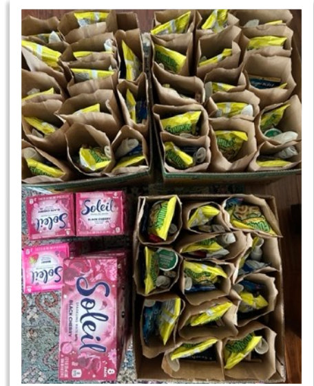
Lunch bags packed by the Seekers and ready for delivery to our Trinity Center neighbors.