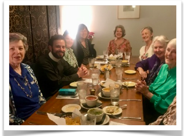
Daughters of the King luncheon, 2022