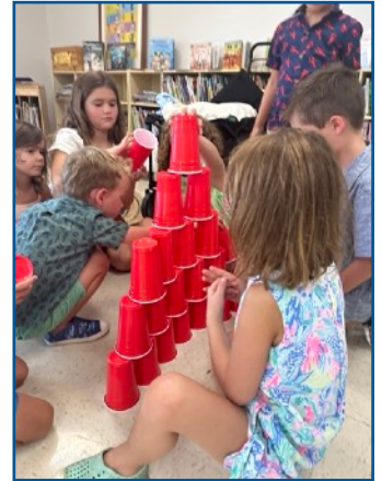
Learning about the Tower of Babel in Sunday School.