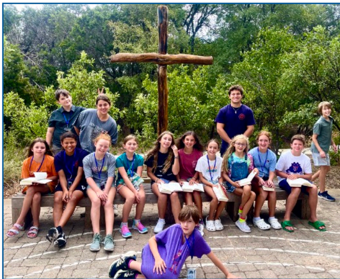
Our Episcopal Youth Community gathered in the courtyard for Compline during their second Sunday together.

ZOOM INFO: bit.ly/BibleStudyZoomLink Meeting ID: 832 6049 2080; passcode: bible.