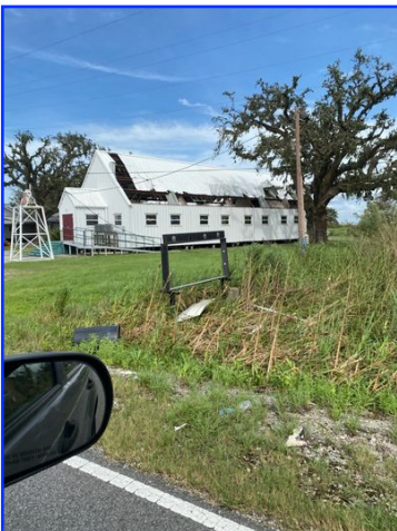
Left: St. Andrew's Episcopal in Bayou DuLarge.