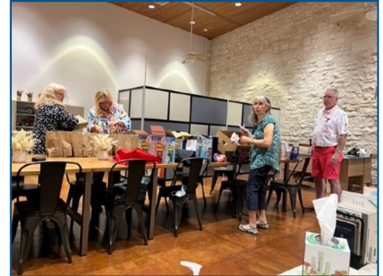
Stephen Ministers pack bag lunches for Trinity Center neighbors.