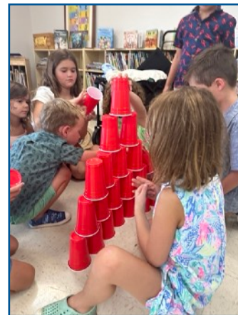
Learning about the Tower of Babel in Sunday School.