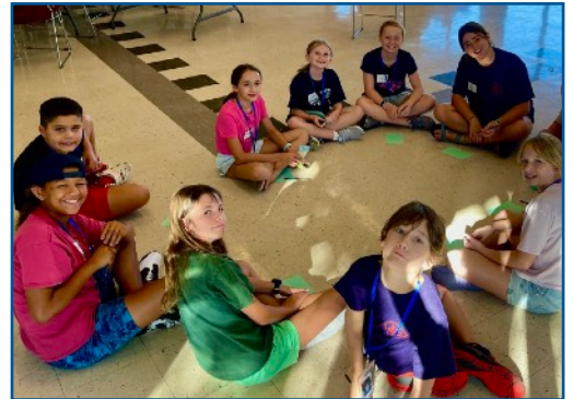
5th & 6th graders getting to know each other in small groups.

Sign up for a Sunday and see more details at bit.ly/SMEYC_Snacks_Signup . Contact Bonnie with any questions: youth@st-michaels.org .