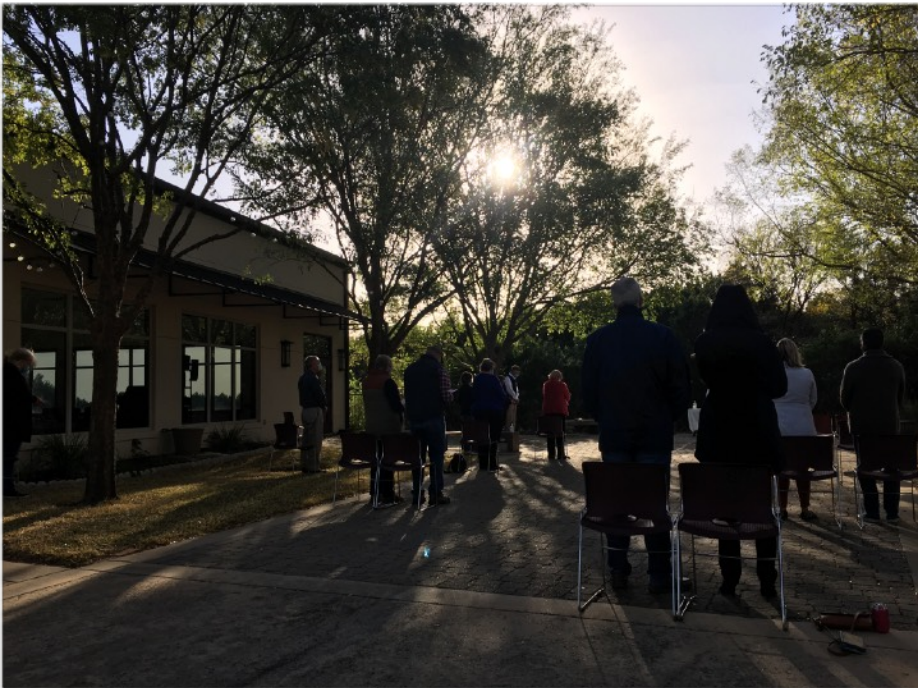
Worship al fresco in the St. Michael's courtyard—sunshine and Sonshine.