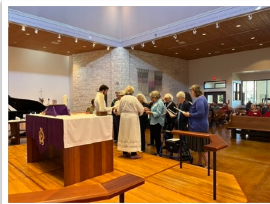
On Sunday, December 10, during the 11am service, the Daughters of the King welcomed three new members into their order.