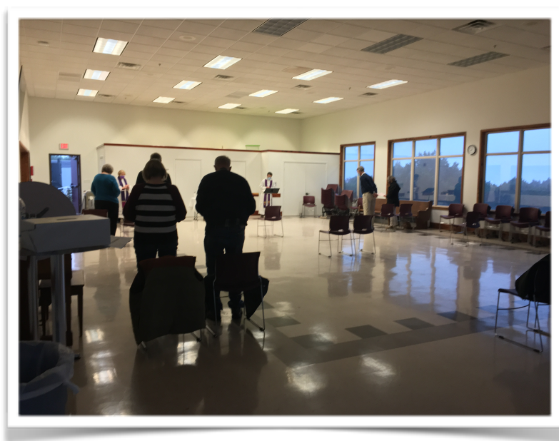
The chilly, misty weather finally got the better of our outdoor services this past Sunday, so the 8 am folks stayed very spaced out in the parish hall with the doors open.